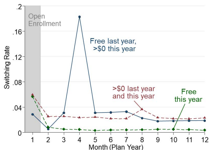
Figure 2: Rates of Automatic Retention (2010-12), by Origin Plan's Premium

Note: Figure 2 shows automatic retention rates for enrollees in the Massachusetts health insurance exchange, by plan premium status. About 14% of enrollees were auto-retained each year, rather than being disenrolled. The most common situation occurs when plans transition from zero- to positive-premium (blue series), after which about 18% of their enrollees do not initiate premium payment and are auto-switched rather than being disenrolled.