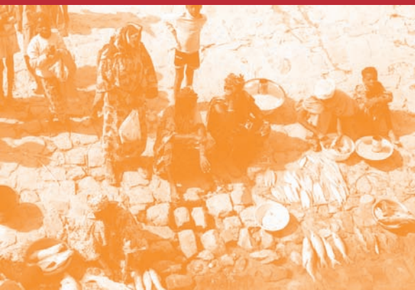
Fish sellers on the banks of the Niger River. Mali, West Africa.